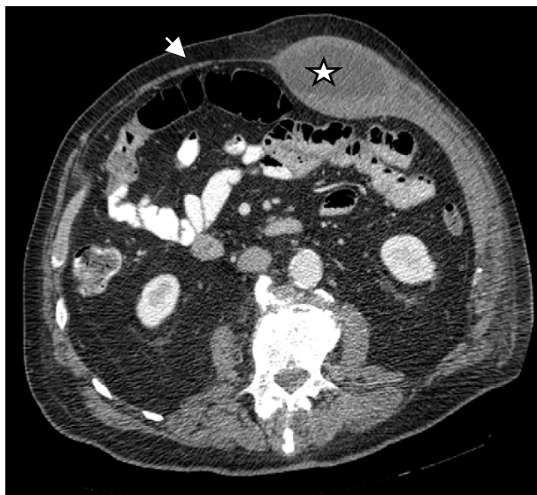
Figure 1. Shows the computed tomography of a 90-year-old male patient who was hospitalized for pneumonia (patient 2 in Table 1 ). Note the large RSH in the musculus rectus abdominis on the left (asterisk) and the thin muscle layer on the right (arrow). The patient received LMWH overlapping to OAC due to subtherapeutic INR levels. The INR at event was 2.0, thrombocyte count was normal. He received despite Vitamine K a 4-factor concentrate to optimize coagulation patterns. The baseline kidney function was mildly reduced and declined to stage III renal failure. After complete recovery with conservative therapy he could be discharged at home.

patients died (38%). These patients were 90 - 92 years old, female and had chronic renal failure with a mean GFR of 53 ml/min/1.73 m 2 (range 39 - 71 ml/min/1.73 m 2 ). The observed change in hemoglobin was 42 - 58 g/L. Two patients were on OAC and LMWH bridging therapy (INR 3.1 and 3.5, resp.). One patient was on OAC with an INR of 1.1. An autopsy was not performed. The cause of death was progressive renal failure with metabolic acidosis in two patients and heart and renal failure in one patient. None of these patients received intensive care with renal replacement therapy according to the wishes of these elderly patients.