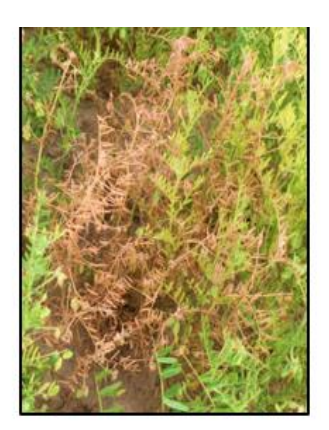
Plate 1. Field showing the infection of lentil wilt disease