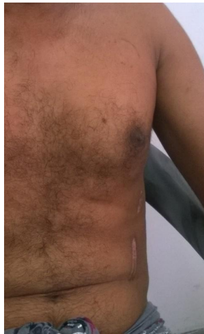
Fig. 3. Trauma to front of the chest and abdomen