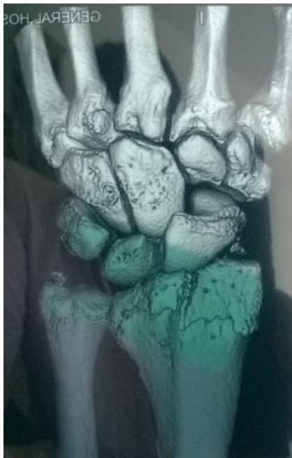
Fig. 2. Distal radial and ulna fractures