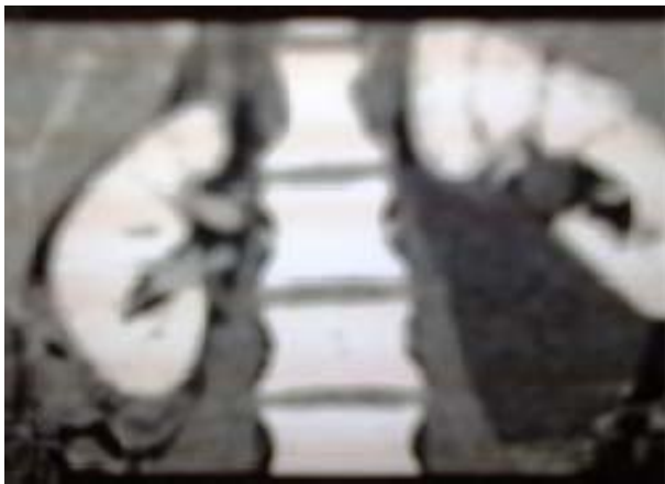
Figure 2. Contrast enhanced CT scan abdomen (Axial and Coronal cuts) showing a cystic lesion infero-medial to left hydronephrotic kidney. Significant mass effect at renal hilum is seen.