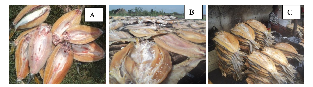
Figure 2. Angara fish samples: A: Gutted Angara samples on ground at the landing site; B: Sun drying of split fish on raised platforms and C: Angara fish on stalls in different markets.