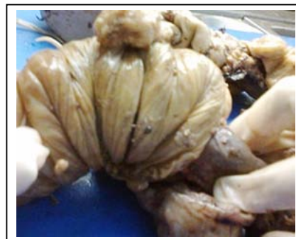
Fig.2: Gross photograph of an intestinal resection specimen, showing ileoileal intussusceptions with mucosal polyps (leading factor).