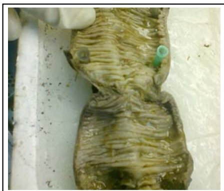
Fig.1: Gross photograph of an intestinal resection specimen showing a transverse mucosal stricture

In this prospective study 120 intestinal resection specimens from patients presenting with clinical or radiological features of intestinal obstruction and perforation between January 2012 to April 2013 were included. Detailed history and basic lab investigations were recorded from the patient files. Resected segments were received fixed in 10% formalin and the specimen after opening up was fixed overnight in formalin on cork board. Detailed gross examination was carried out for strictures, ulcers, perforations, polyps, tumours, enlarged lymph nodes, volvulus and intussusception in relevant cases. Minimum of three blocks were taken from strictures and ulcers, two blocks each from the perforation margins and from adjoining wall. In case of multiple polyps, sections from largest or ulcerated polyp were taken following the standard