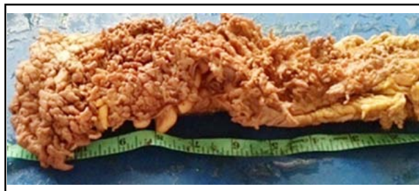
Fig.3: Gross photograph of intestinal resection specimen, showing multiple pseudopolyps carpeting the whole mucosa of a case of Ulcerative Colitis.

colic intussusception was idiopathic with no demonstrable lead point.