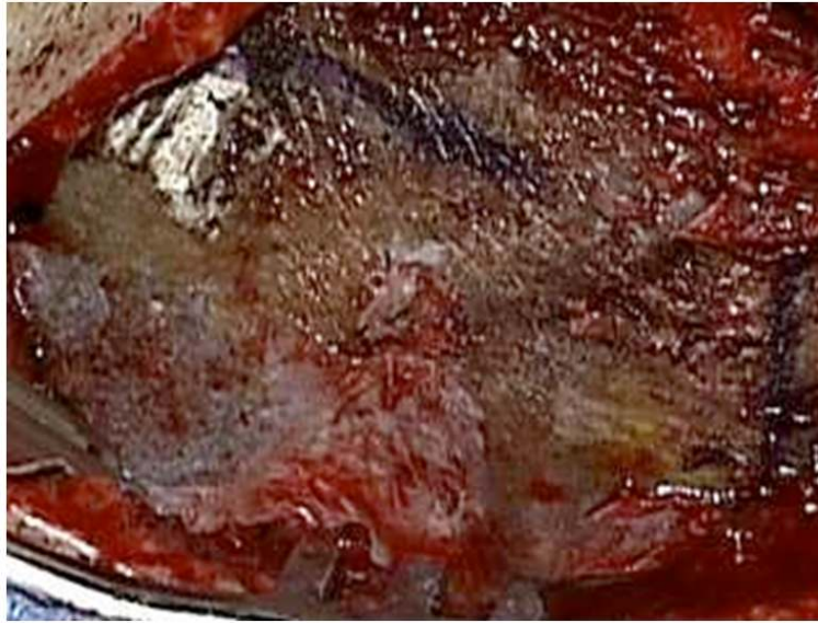
Fig. 1. Pigmented outer cortex of the parietal and temporal bones

The encountered pigmentation faded away with drilling from the mastoid cortex medially towards the antrum and middle ear structures; however, isolated pigmentation of the lenticular process of the incus was observed (Figs. 2 and 3).