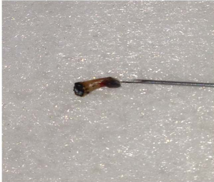
Fig. 3. The needle is pointing to the pigmented lenticular process of the incus bone. The discoloration on the other end is an artifact of laser resection

The ossicular chain was mobile with no other noted architectural or functional deficits. The middle ear implant was successfully placed surgically with no variations from normal protocol.