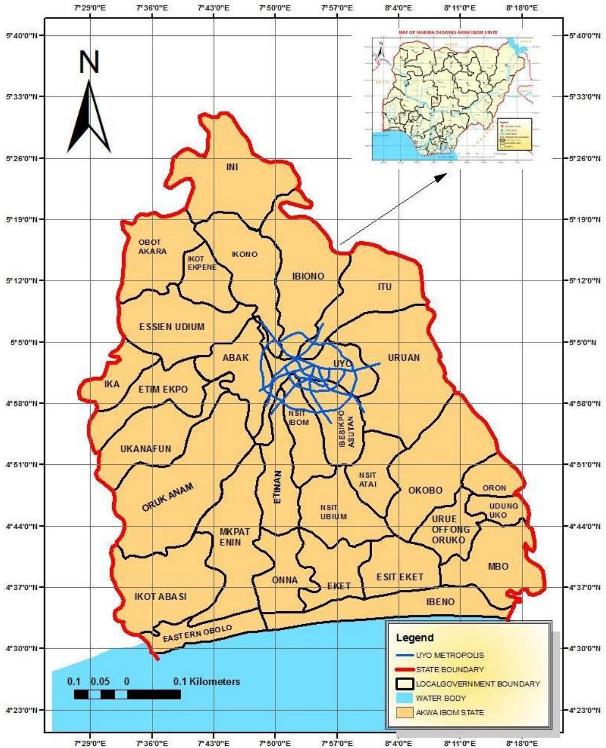
Fig. 1. Map of Akwa Ibom State showing Uyo Urban Area

Lee et al. [5] stated that “the characteristics of recreational facilities are determinants of facility use and physical activity, yet there are few validated and extensive audit tools gauging characteristics of recreational facilities”.