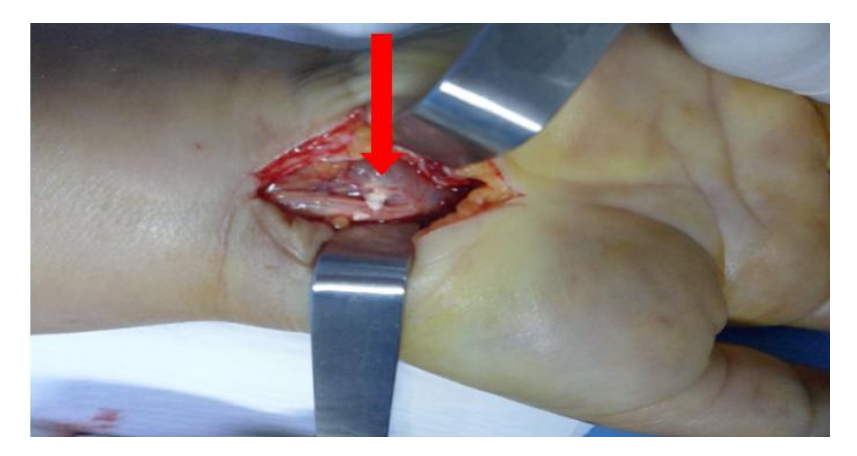
Fig. 1. Peroperating view showing palmaris profondus tendon with compression of median nerve

joint flexion of middle finger (Fig. 3). The median nerve was congested. After a few weeks the patient's symptoms resolved completely.