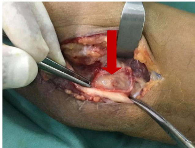
Fig. 3. Intraoperative photograph showing the cyst compressing the ulnar nerve in the cubital tunnel