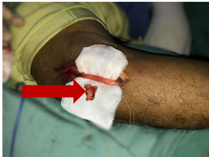
Fig. 4. Intraoperative photograph showing total removal of the cyst