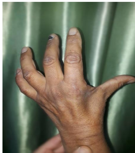
Fig. 1. Clinical photograph demonstrating a claw hand deformity and intrinsic muscle atrophy

To relieve the nerve compression, surgery was planned. After induction of general anaesthesia, interior sweeping 10 cm incision around medial epicondyle was made. The subcutaneous tissues were dissected, identifying the ulnar nerve who was flattened and compressed in the cubital tunnel by a synovial cyst the diameter of which was 2 cm. we resected the cyst completely. After further exploration, we did not find another point of compression. The arcade of Struthers, Osborne's fascia and the deep flexor-pronator aponeurosis were divided. Then, an anterior subcutaneous transposition of the nerve was performed to avoid re-compression by the cyst recurrence. Synovial cyst was confirmed by histopathological examination.