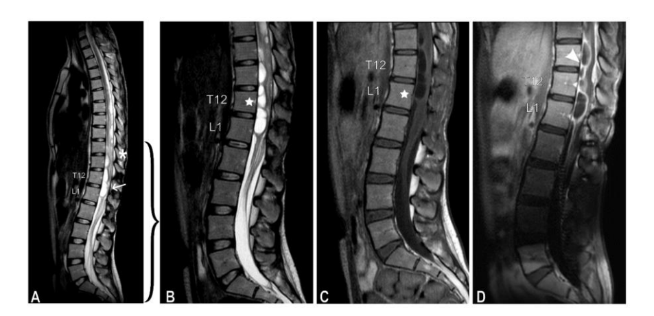
Fig. 3. Follow-up magnetic resonance imaging. (A) Weighted sagittal T2 image of the thoracolumbar spine showing a distorted cord, with edema, and alternating segments of the tethered cord (asterisk) and atrophy (arrow) extending from T6 to L1. (B-C) Sagittal images weighted T2 and T1 focused on the low thoracic and lumbar spine exhibiting a loculated arachnoid cyst with a mass effect on the cord, delimited by arachnoid septations (star). (D) T1 weighted gadolinium-enhanced image revealing pial and dural enhancement (arrow head).

Marquez-Bravo et al.; Asian J. Med. Health, vol. 22, no. 7, pp. 108-114, 2024; Article no.AJMAH.118645