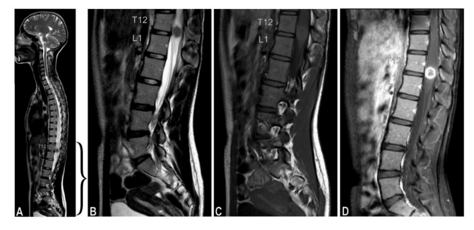
Fig. 1. (A) Neuroaxis magnetic resonance imaging and (B) sagittal T2 weighted image of the thoracolumbar spine showing a hypointense intramedullary lesion at the T12-L1 level associated with cord edema spanning from T6-L1. (C) In the sagittal T1 weighted image a fusiform dilation of the conus medullaris is seen. (D) Gadolinium-enhanced T1 weighted image that reveals a ring enhancing pattern of the lesion

hyperintense halo in the T1 weighted images (WI) and heterogeneous intensity, mainly hypointense in T2 WI, surrounded by cord edema spanning from T6 to L1. On the postgadolinium T1 sequence, the mass exhibited an avid ring-enhancement pattern. Since this mass behaved as a space-occupying lesion (SOL), a provisional diagnosis of glioma or ependymoma was given and resection surgery was offered to the patient.