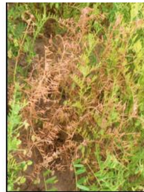
Plate 1. Field showing the infection of lentil wilt disease