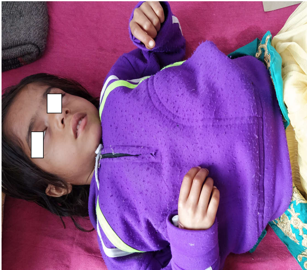
Fig. 1. The patient under unconscious condition

The patient was managed conservatively with the antiemetic drug (Ondesentron), antibiotics (Ceftriaxone, Vancomycin, Amikacin) and anti-viral drugs (Acyclovir) including antipyretic (Paracetamol), for reducing the intracranial pressure (20% Mannitol), antiepileptic (Phenytoin sodium), etc. The patient's health improved within two weeks. She was conscious with no meningeal sign. All the cranial nerves, motor nerves, and sensory nerves were also found normal. Her Glasgow Coma Scale found on the seventh day was 15/15. She was discharged on the tenth day with the advice to her parents for follow-up after one month.