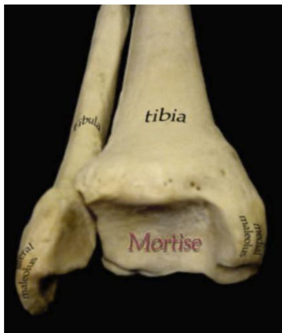
Fig. 1. Ankle mortise

The patients who were presented in the casualty and out-patient department were examined clinically and radiologically. Closed reduction and immobilisation with plaster of Paris was done for all cases. Check x-rays were taken and planned for surgery accordingly. High quality radiographs helps in planning for reduction and choosing proper implants. Radiographic views of contralateral ankle are taken in few cases for comparison. The size and position of the malleolar fragment and involvement of distal tibio-fibular joint was assessed by computed tomography was done in four cases. Magnetic resonance imaging to assess soft tissue injury and ligamentous involvement was done in seven cases and is useful to obtain good functional outcome. Displacement and stability of the fracture was assessed by X-rays. In displaced fracture reduction was done immediately to maintain tibiotalar congruity. Stress radiographs were done in ten cases to assess preoperative syndesmotic injury. In syndesmotic instability Shenton's line broken and Dime sign\Ball sign present.