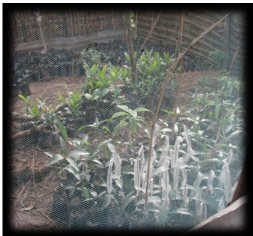
Plate 3. Prepared seedlings to be planted