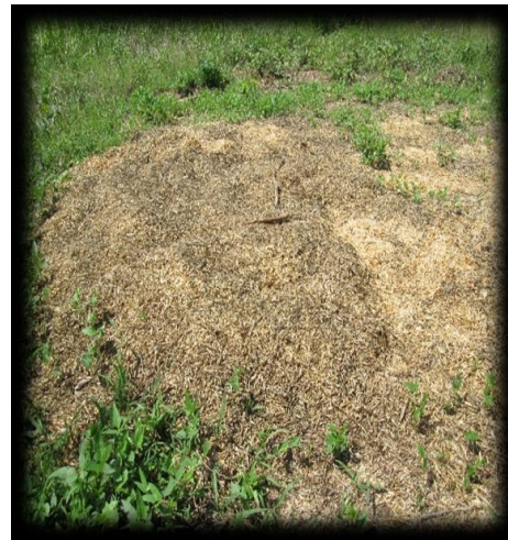
Plate 8. Residue gathered to be put into a compost pit