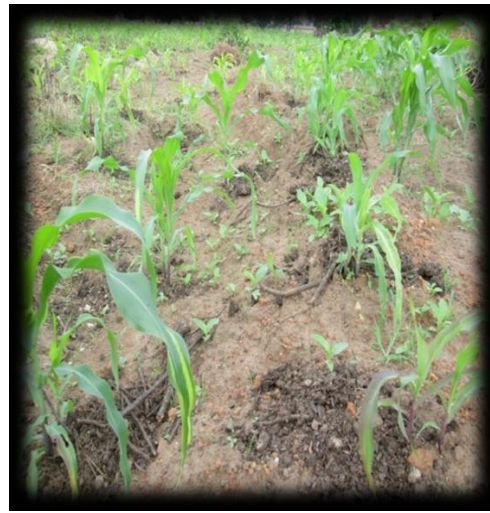
Plate 2. Applied compost to maize at Balee