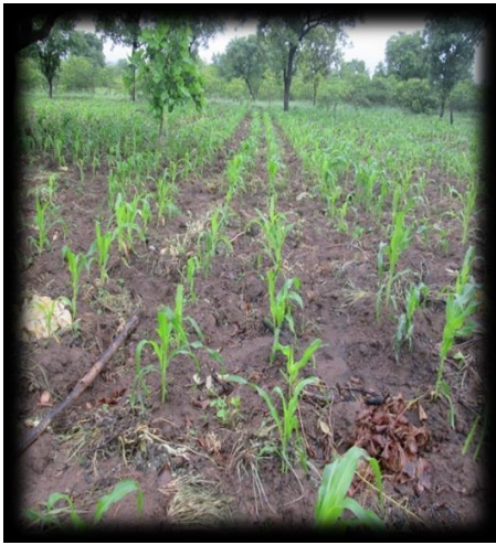
Plate 5. Row/line planting