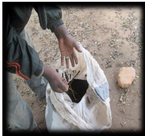
Plate 4. Compost ready to be applied