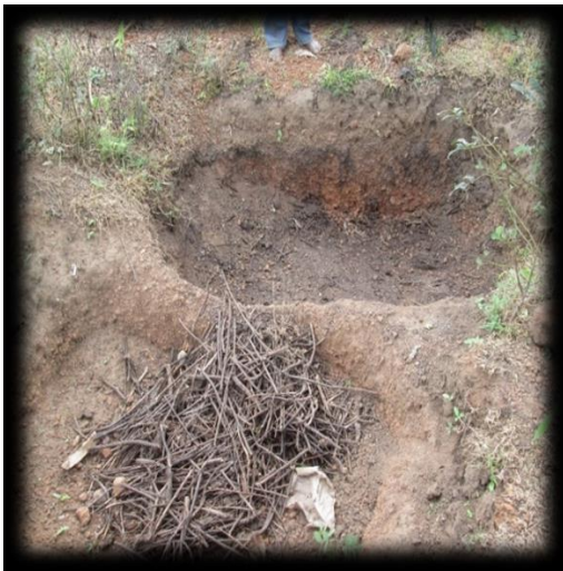
Plate 1. Compost pit at Blema (compost removed)