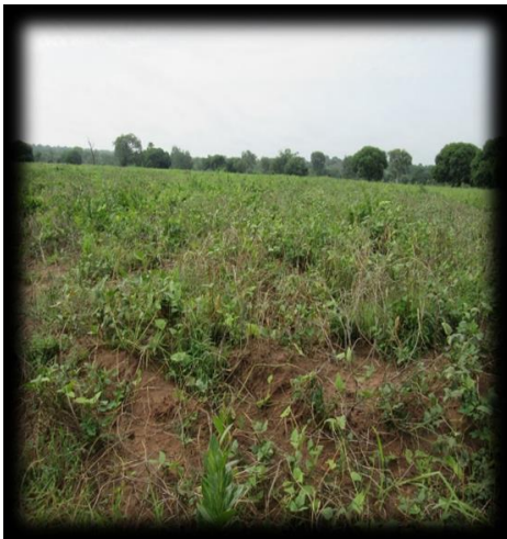
Plate 7. Rotation with cowpea