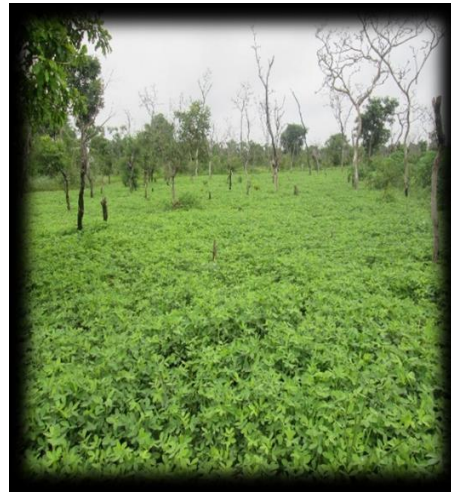
Plate 6. Rotation with groundnuts