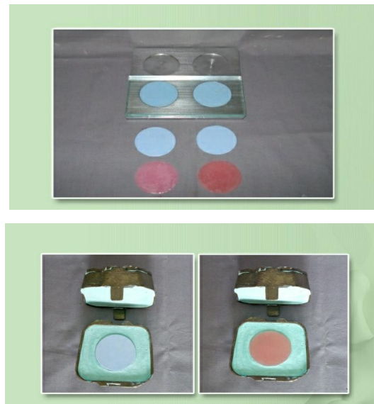
Fig. 1. Duplication of master die with additional silicon putty impression material and preparation of resin sample

they were removed from the dental stone after the stone is set. Separating media was applied over the stone mold. According to manufacturer's instructions, for both resins, powder and liquid were mixed for 15- 30 seconds in a porcelain jar and left to polymerize. When the dough stage was reached, the resins were packed into the molds; flasks were closed under pressure using bench press (3.5 psi) and allowed for bench curing for 30 minutes. Forty samples of each resin were placed in regular water for 60 minutes, maintained at 68°C for 30 minutes and boiled for 20 minutes (short curing cycle). After processing, the flasks were allowed to bench cool for 30 minutes, followed by immersion in running water for 15 minutes. After deflasking, flash and excess resin was removed by using acrylic trimming burs and then polishing on both sides was done using 600, 800, 1000 and 1200 grit silicon carbide paper. By using carbide straight fissure bur resin samples were marked from 1 to 10. Total 60 specimens were made from which 10 specimen from each denture base resin (I and II) for three disinfectant solutions (A, B & C). 10 additional specimens from each resin specimens were also made as control group (Fig. 1).