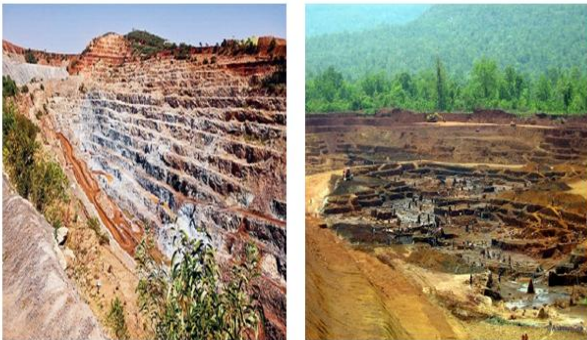
Fig. 1. Sukinda chromite mine

The observations on tree growth were recorded as per standard procedures from 10 individual trees of same species from three plantation blocks and the average data was recorded. The height of tree species was measured vertically from ground level to tip of the leading shoot with the help of Ravi altimeter. Diameter at Breast Height (DBH) over bark of trees was measured at a height of 1.37 m with the help of calliper in two directions (major axis and minor axis) and the average was computed and expressed in centimetre (cm). The secondary branches were counted and average data recorded. Similarly, crown spread was measured along the widest diameter of crown. Crown length was measured as the vertical depth of the crown of a tree from the tip to the point halfway between the