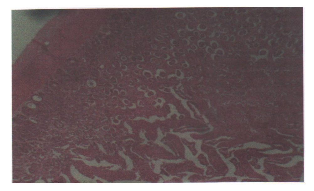
Plate 1. Chicken intestine shows necrotic enteritis x40

cardiac muscle fibers while in the infected but untreated group, there were erosion of the trachea, duodenum and small intestine with necrosis of intestinal mucosa and proventricular glands. The lungs and kidney were congested and there was myocarditis with mononuclear infiltrations of cardiac muscle fiber. Spleen was necrotic with depletion of mature lymphocytes. In the uninfected and untreated groups, all organs and tissues examined were normal.