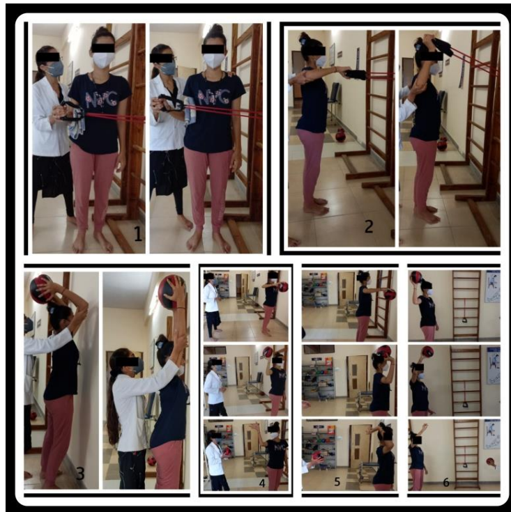
Fig. 2. Ballistic six training

Image 1: External rotation with latex tube; Image 2: 90/90 external rotation with latex tube; Image 3: Overhead soccer throws using a 6-lb fitness ball; Image 4: 90/90 external rotation side-throw using a 2-lb fitness ball; Image 5: Deceleration baseball throws using a 2-lb fitness ball Image 6: Baseball throws using a 2-lb medicine ball