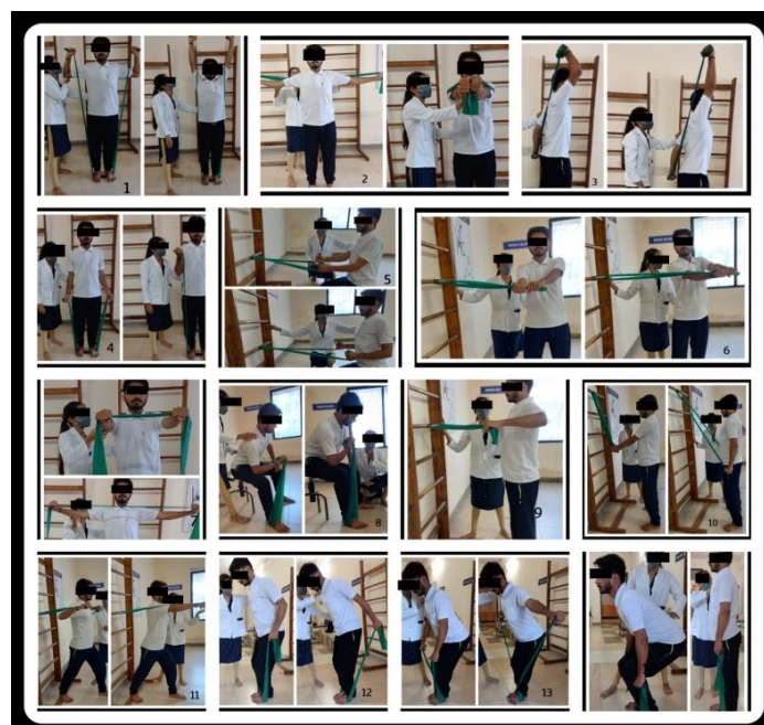
Fig. 3. Theraband exercises

Image 1: External rotation with latex tube; Image 2: 90/90 external rotation with latex tube; Image 3: Overhead soccer throws using a 6-lb fitness ball; Image 4: 90/90 external rotation side-throw using a 2-lb fitness ball; Image 5: Deceleration baseball throws using a 2-lb fitness ball Image 6: Baseball throws using a 2-lb medicine ball